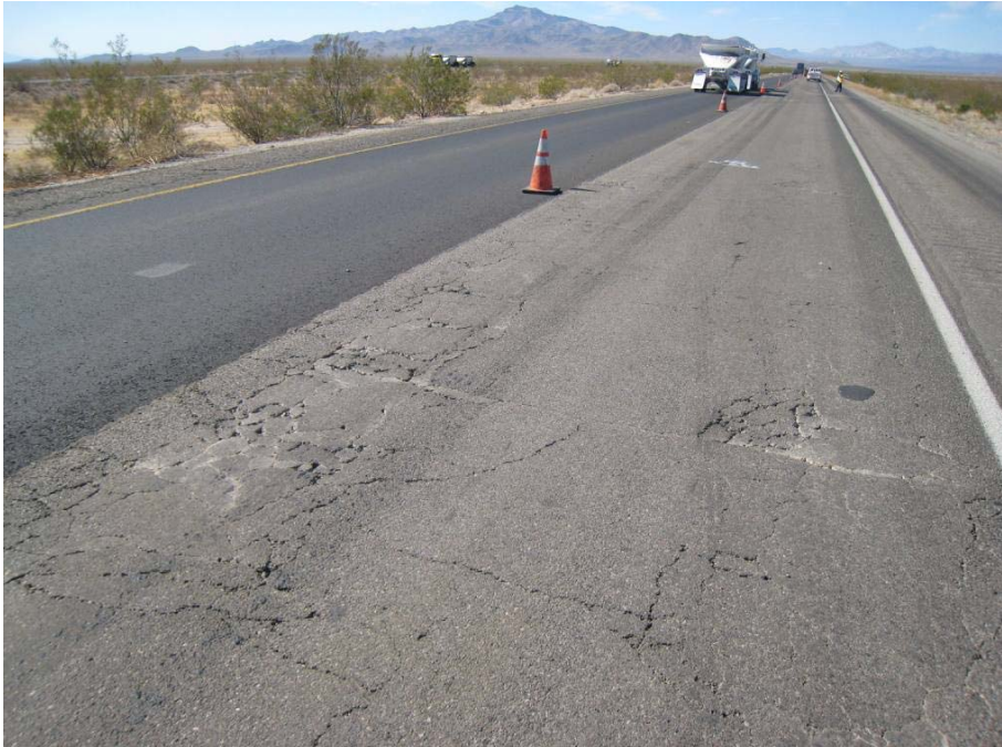
I-40, looking West, PG 64-28PM Test Section