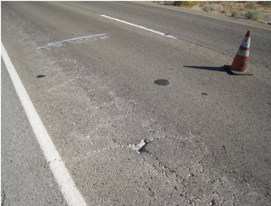
I-40, Pavement condition in PG 64-28TR Test Section (at 120 meters)