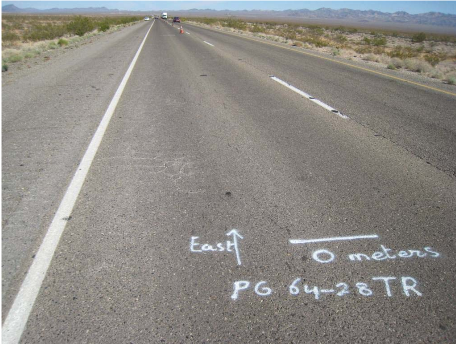
I-40, looking East, PG 64-28TR Test Section