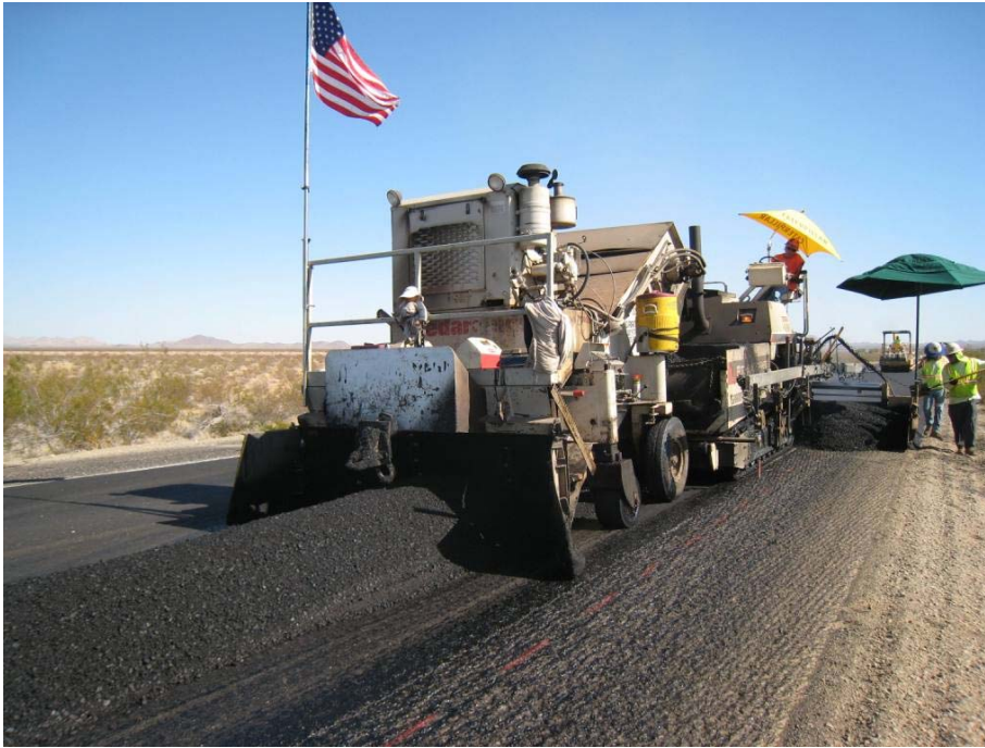
I-40, Granite Construction windrow paving, PG 64-28PM