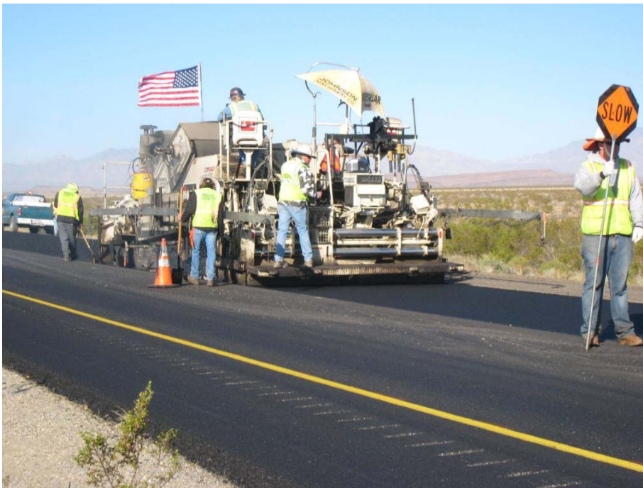
I-40, Paving of Test Section, PG 64-28TR