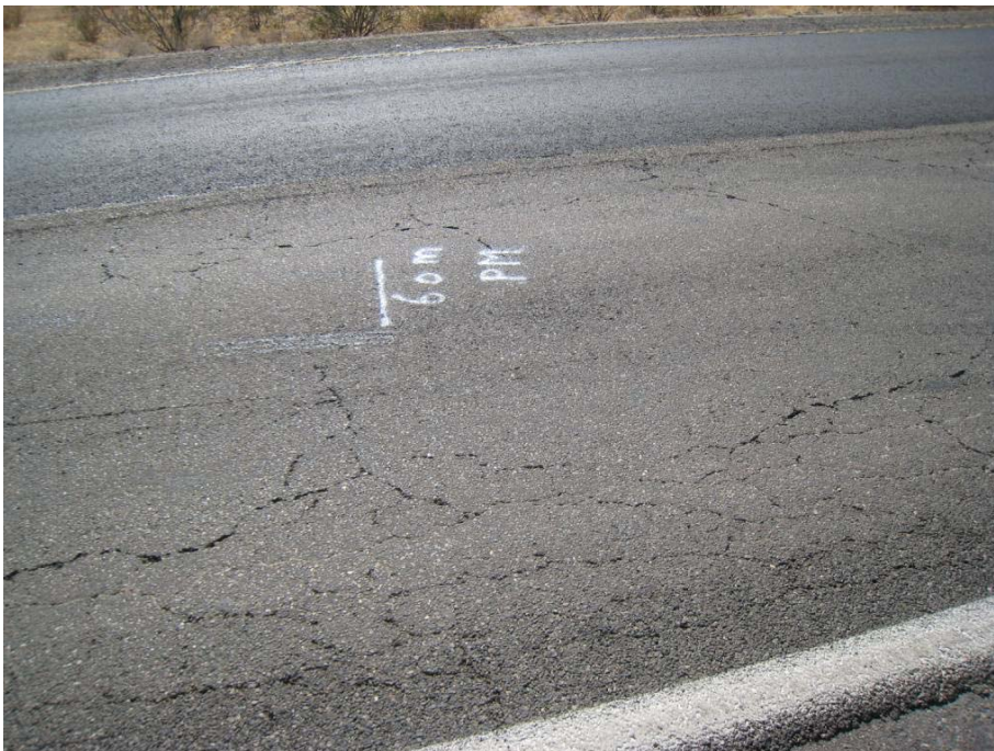
I-40, Pavement condition in PG 64-28PM Test Section (at 60 meters)